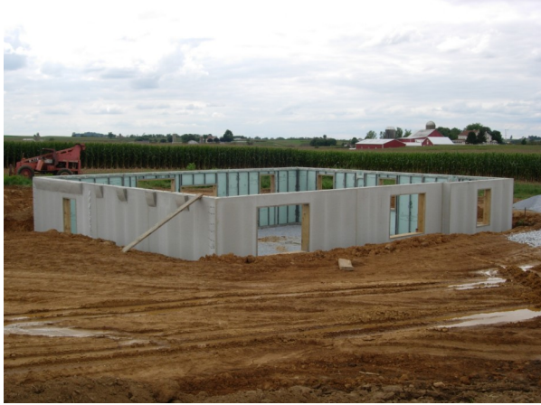
BRICK AND CONCRETE LEDGES